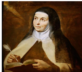
St Teresa of Avile, the Reformer of Carmel

A summary of the obligations – The tertiary when received into the Discalced Carmelite Third Order will receive a brown scapular composed of two equal parts of 10 inches in length and 7 inches in width. It is to be worn at all times. The new novice will also be given a religious name at this time. A period of at least one year and one day must elapse, before the novitiate ends and the Profession ceremony takes place. The novice will at this time make a vow of Chastity and Obedience. Before Profession, the novice will make a retreat or other pious practices according to the advice of the