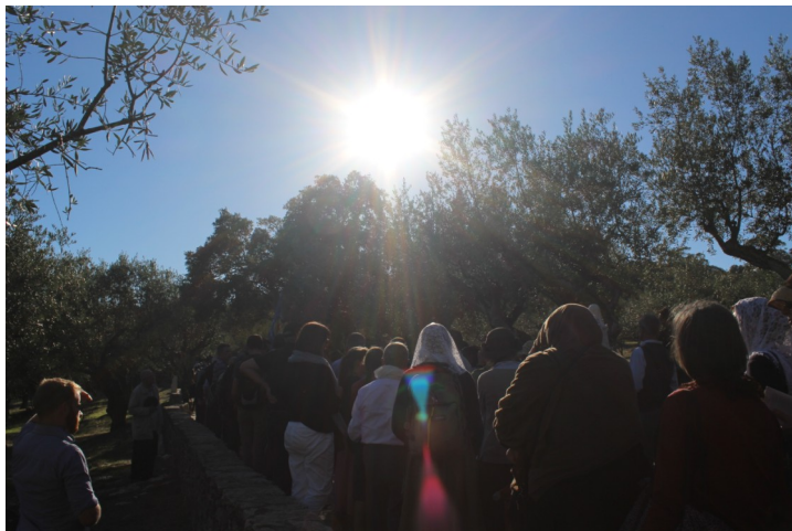
The Sun during the Stations of the Cross

May this small effort made for the conversion of Russia deserve us the grace to keep the dogma of faith in our souls and to collaborate for the triumph of the Church, not only on the schism of the East, but also and above all, on liberalism and modernism that oppose the reign of Christ the King over all peoples.